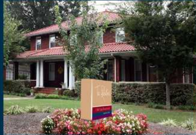
It all began at the youth crisis center. Today we serve youth in crisis in three locations.

Today we serve more than 6,000 youth, young adults, and families each year, empowering them to become self-advocates and find viable, long-term paths to success. Our three locations include the youth crisis center serving runaway and homeless youth ages 7-17, a transitional living home for young adult males aging out of foster care and a resource center for young adults ages 16-24.