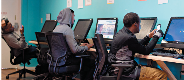
12 young children have been placed in safe homes because their parents received rental assistance through our housing program